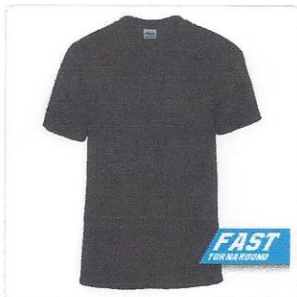
BLACK BASIC SHORT SLEEVE T-SHIRT