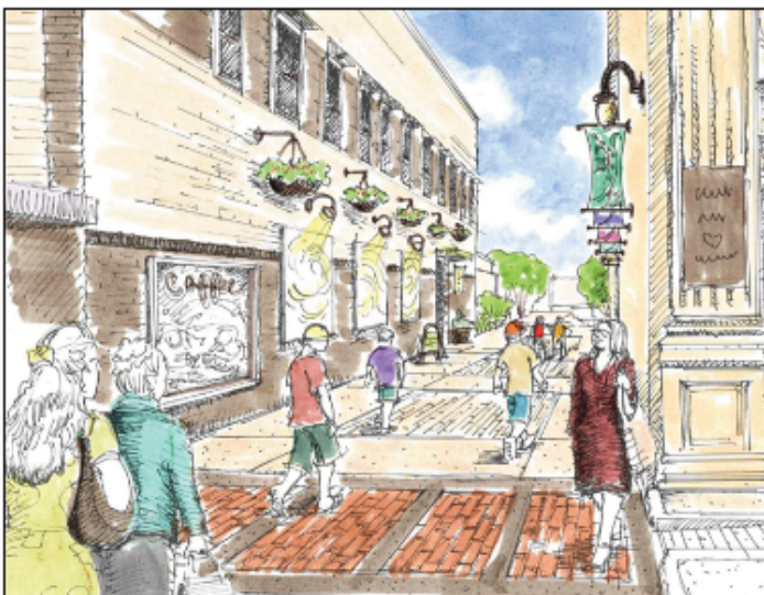
Alley Corridor Enhancements